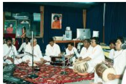
an open audience based on the Teachings of Bhagawan Sri Sathya Sai Baba.

The future plans include using multi-media presentations to reach out to younger audiences and preparation of short video documentaries suitable for